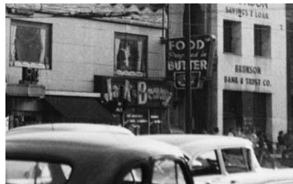
The original Jack & Benny's at Broad Street & High Street circa 1957