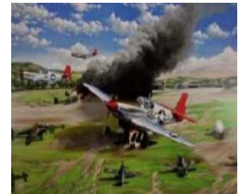
301st Fighter Squadron