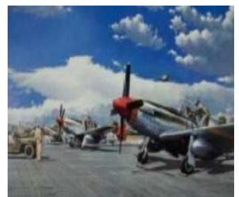
302nd Fighter Squadron