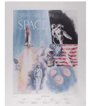
Naval Aviators in Space