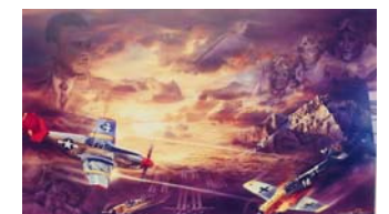
The Legend of the Red Tails

This painting depicts a World War II battle in Germany involving the Tuskegee Airmen, a group of African-American military pilots (fighter and bomber). They formed the 332 nd Fighter Group and the 477 th Bombardment Group of the United States Army Air Forces.