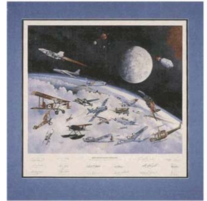
Gathering of Eagles

*WPAFB Wright Patterson Air Force Base **CNAR Cleveland National Air Races ***EJA Executive Jet Aviation ****STS Space Transportation System, denotes Space Shuttle