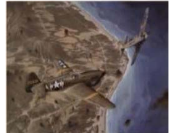
99th Fighter Squadron