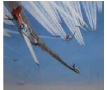
100th Fighter Squadron