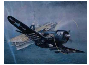
He Who Dares

Thomas Hudner was later awarded the nation's highest award for bravery, the Medal of Honor, for his attempted rescue of Jesse Brown.