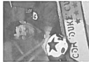
Randall Cunningham 1972

Only Ace in Vietnam conflict flying F4 Phantoms with VF-96 with five confirmed kills including three in one flight and victory over North Vietnam's leading fighter pilot.