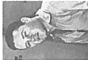
Pappy Boyington 1943

Medal of Honor recipient as Commanding Officer of VMF-214 "Black Sheep" flying F4U Corsairs in the Pacific Theater in World War II. Ranking Marine Corps Ace with 28 victories.