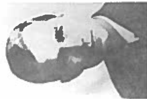
George Bush 1942

The 75th Anniversary of Naval Aviation Commemorative was conceived as a tribute to the heritage of naval aviation and the people who have made it great. The painting features 12 flight vehicles representing the 12 distinguished naval aviators whose individual signatures are affixed to the print. Selection of participants was made based on accomplishment and representation of the widest possible span of naval aviation communities and time periods associated with the history of naval aviation.