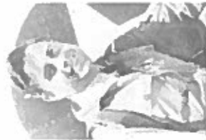
Jeremiah Denton 1955

United States Senator from Alabama. Among senior Vietnam conflict POW's surviving over 7 1/2 years of captivity. A-6 Intruder combat pilot as prospective commanding officer, with Medium Attack Squadron 75 aboard USS INDEPENDENCE.