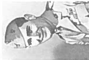
Joe Foss 1942

Former two term Governor of South Dakota. BGEN South Dakota National Guard. Second ranking Marine Corps Ace with 26 victories. Medal of Honor recipient in the Pacific combat theater in World War II flying the F4F Wildcat.